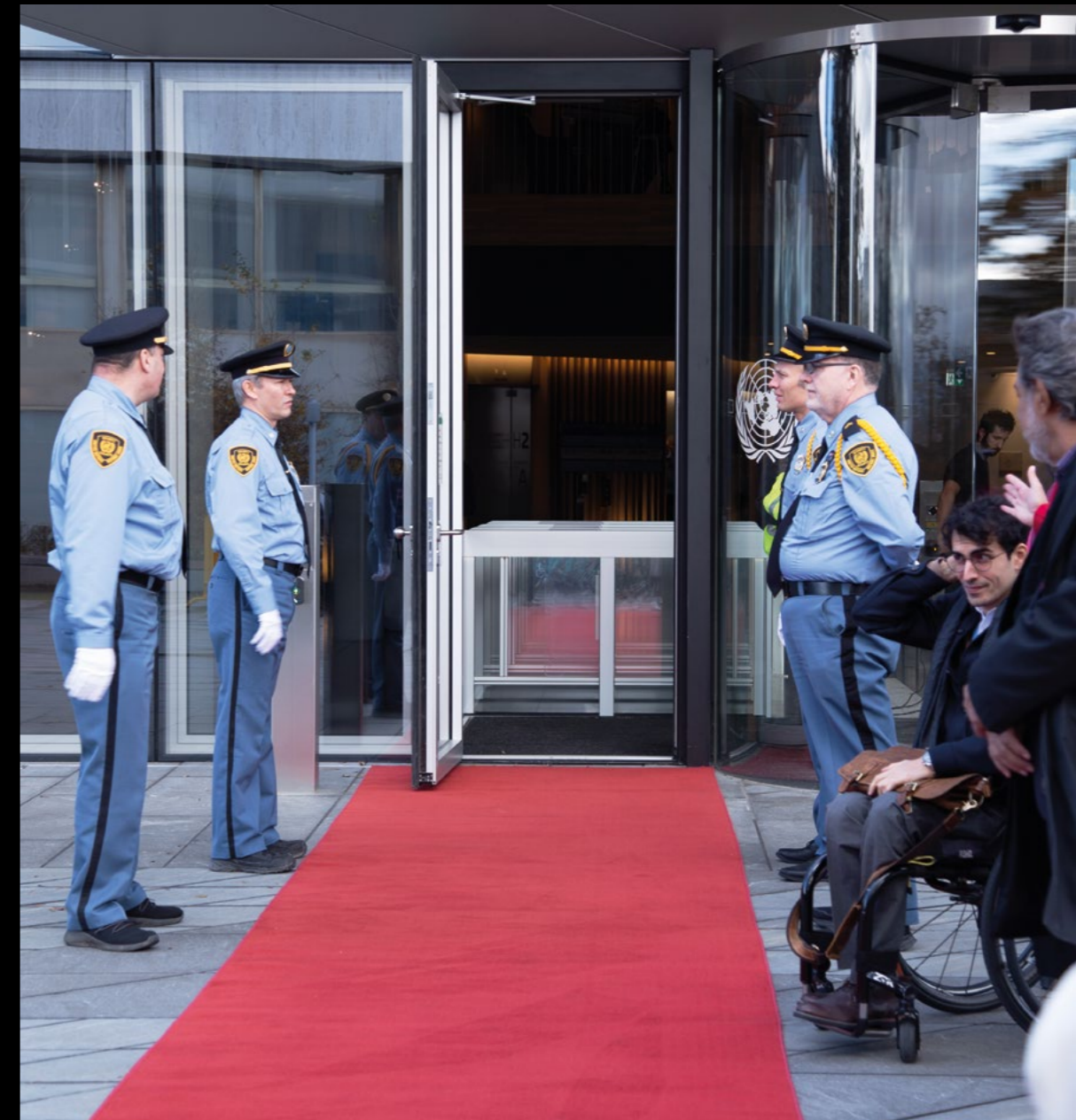
Protocol staff and Security and Safety Service officers prepare to welcome high-level visitors to a meeting at UN Geneva.