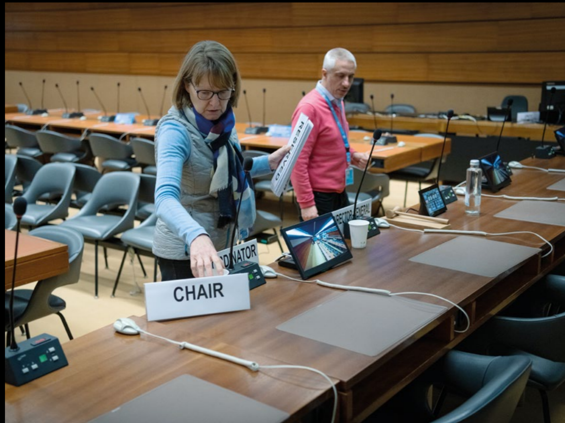
A staff member from the Office of the Director-General sets up nameplates for a meeting.