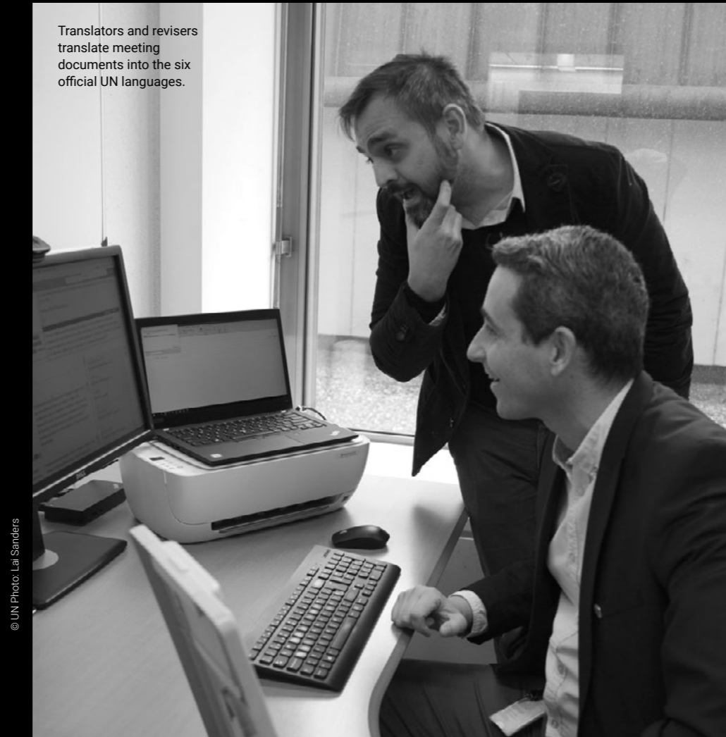
Translators and revisers translate meeting documents into the six official UN languages.