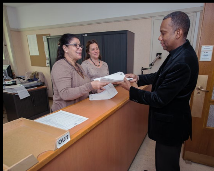
Staff members from the Division of Conference Management hand out conference documents at a distribution counter.