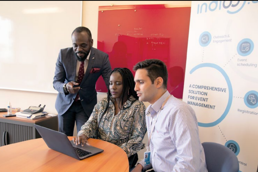
Staff members from the Division of Conference Management work on Indico, the portal that people use to register for meetings and events at UN Geneva.