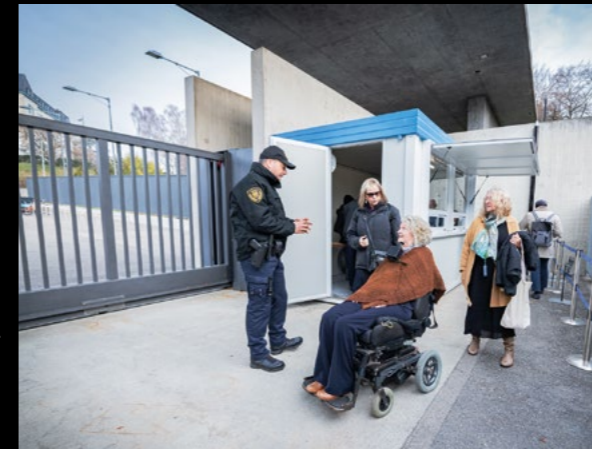
Security and Safety Service officers assist persons with disabilities in accessing the Palais des Nations.