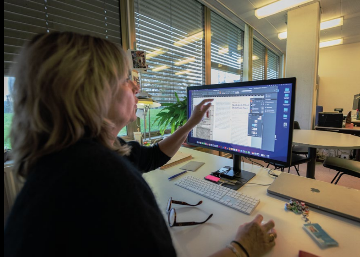
A graphic designer works on a report.