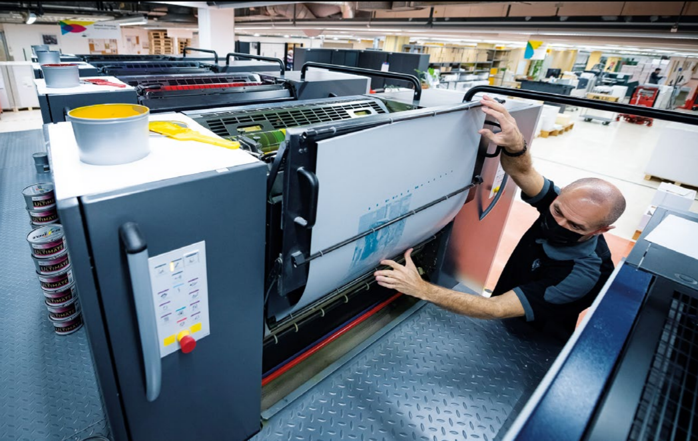
In UN Geneva's print shop, a staff member oversees the printing of documentation and publications.