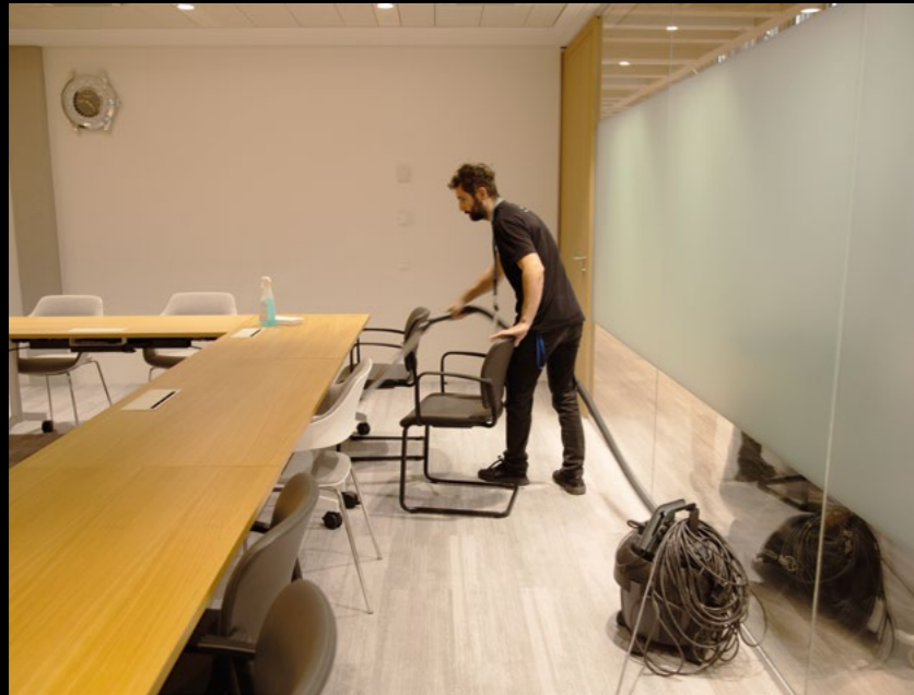
Cleaning staff prepare a meeting room in Building H.