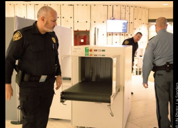
Security and Safety Service officers set up X-ray screening equipment in front of a conference room.