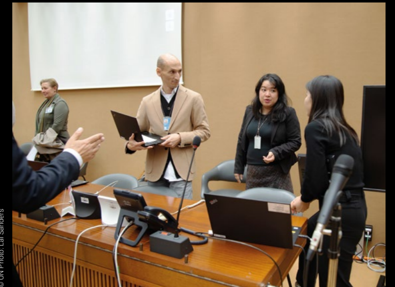
A staff member of the Geneva branch of the United Nations Office for Disarmament Affairs assists delegates.