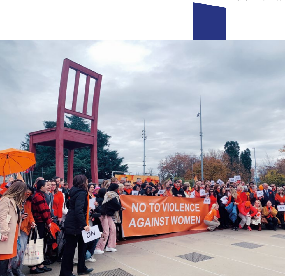
Representatives of permanent missions, UN agencies and civil society organizations in Geneva participated in events for the 16 Days of Activism against Gender-based Violence campaign.