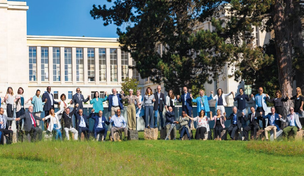
Participants at the meeting of directors of United Nations Information Centres