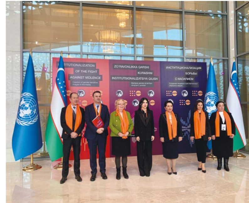
The Director-General of the UN Office at Geneva, Tatiana Valovaya (third from left), at the opening of an international conference on preventing and responding to gender-based violence, held in Tashkent, on 7 December