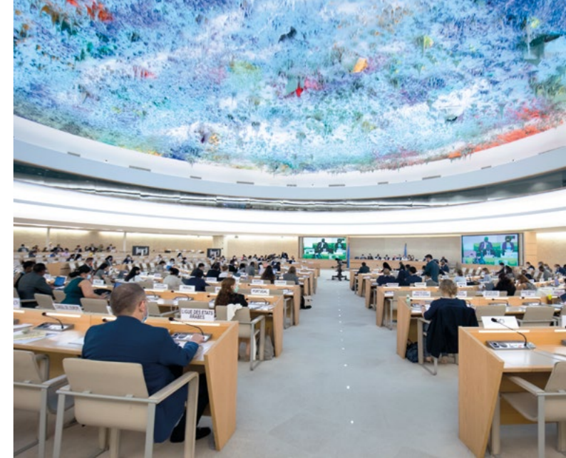
The 50th session of the Human Rights Council, being held in the Human Rights and Alliance of Civilizations Room of the Palais des Nations