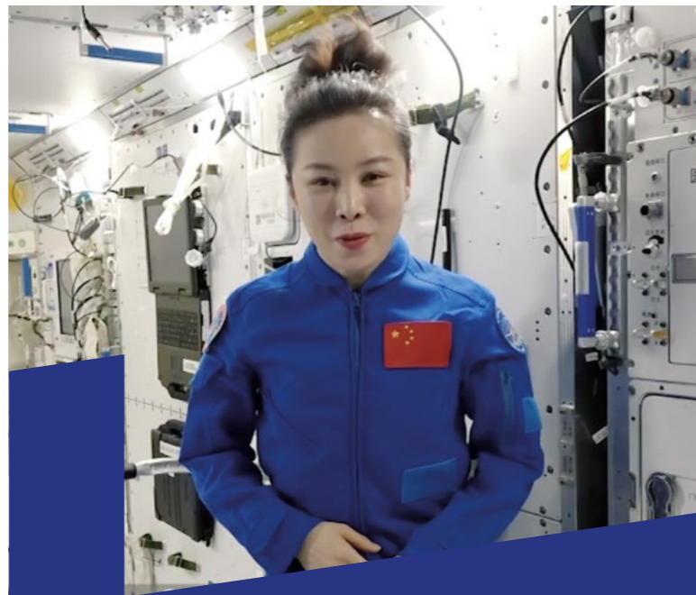
Chinese astronaut Wang Yaping delivers a message from the Chinese Space Station for International Women's Day 2022.

Scan the QR code to watch the series of videos produced by UN Geneva for International Women's Day 2022.