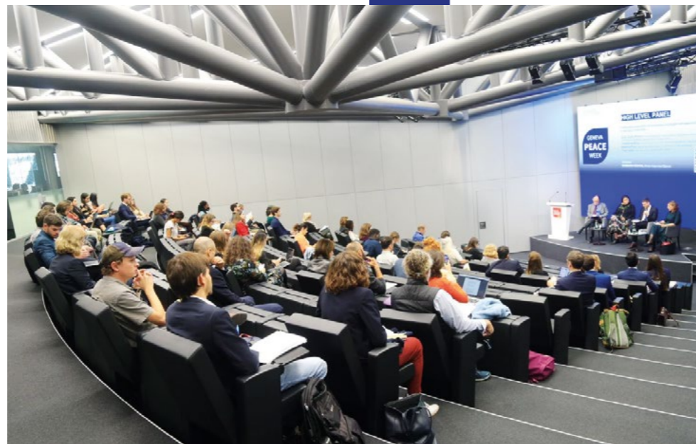
A high-level panel entitled “Environmental challenges and opportunities for peace in a new age of insecurity” at Geneva Peace Week

This flagship event was organized by the Geneva Peacebuilding Platform , the Geneva Graduate Institute and UN Geneva, with the support of Switzerland.