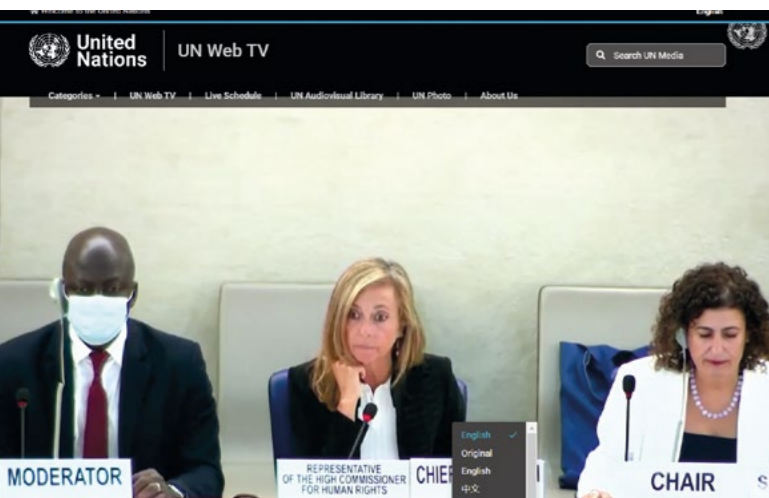
The United Nations Information Service in Geneva brings the work of the human rights treaty bodies to a global audience via UN Web TV.

Some 400 meetings of the 10 human rights treaty bodies were webcast from Geneva in 2022. These webcasts complement the existing meeting coverage provided by the United Nations Information Service in Geneva, which documents the proceedings of the treaty bodies in concise summaries .