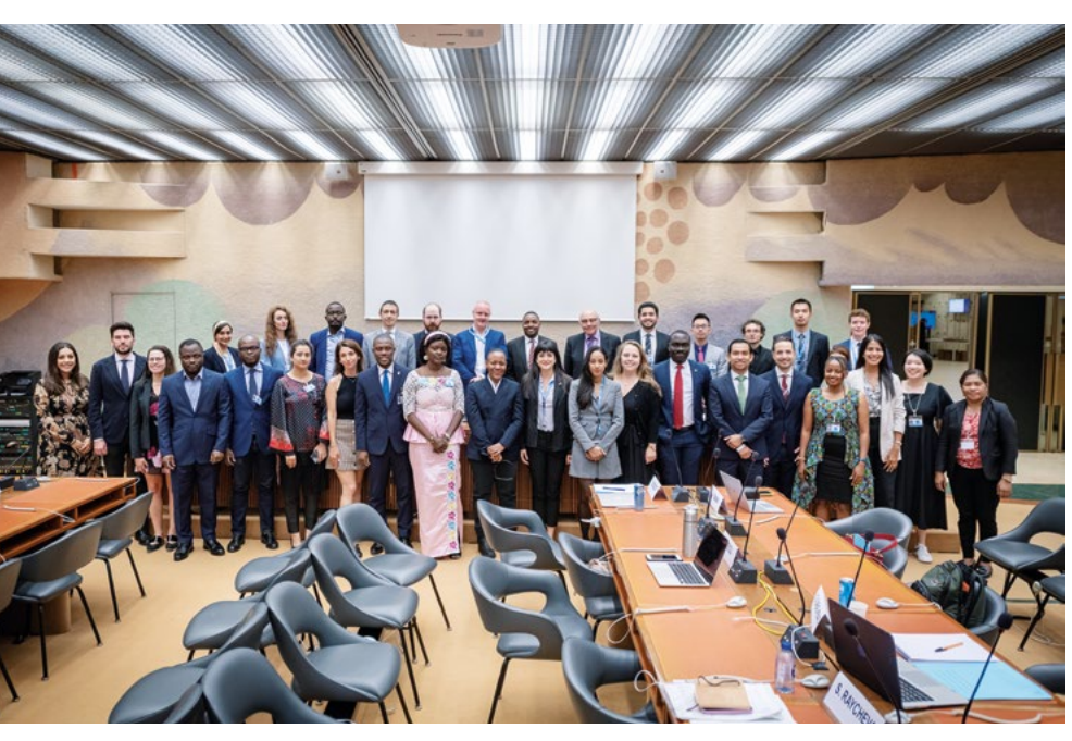
Participants in the 56th session of the International Law Seminar