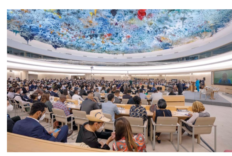
The annual summits of the World Economic Forum Global Shapers and the Forum of Young Global Leaders at the Palais des Nations brought together more than 1,000 young people – both in person and online – from some 140 countries.