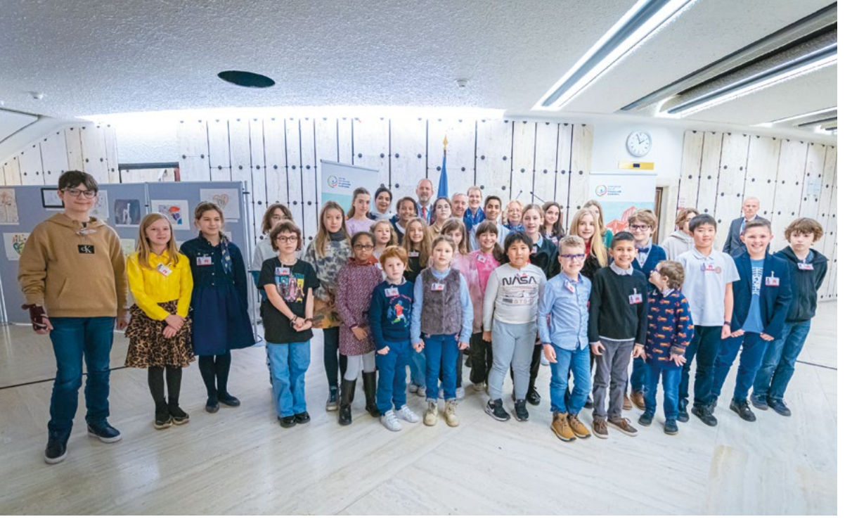
The winners of the children's drawing competition on the theme of "Making a world that includes persons with disabilities"