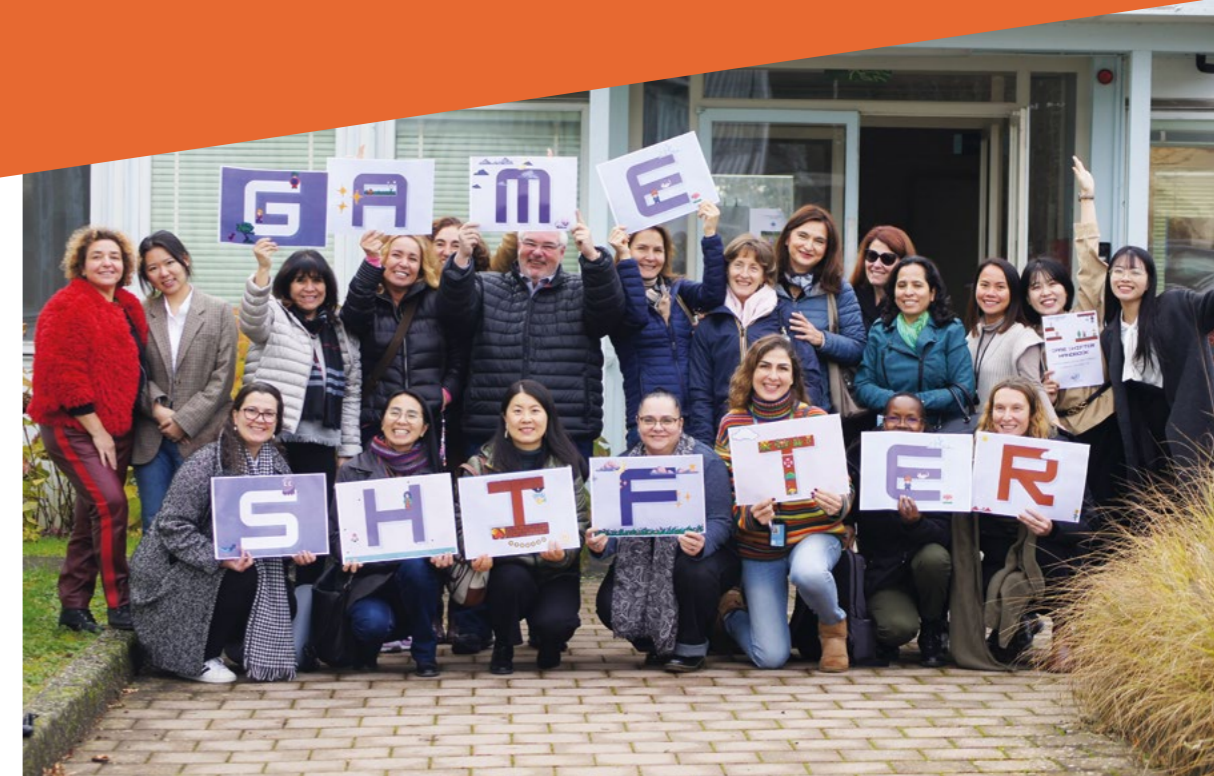
The inaugural cohort of the Game Shifter programme

Game Shifter provides the transformational approach to leadership development that today's fast-paced and constantly changing environment is looking for. It offers a unique opportunity for General Service staff to create their own narratives around leadership and rediscover their natural leadership superpowers. Game Shifter demonstrates the necessary mindset shift to help participants break free from traditional notions of leadership and understand how their strengths can be used as catalysts for positive change in the Organization.