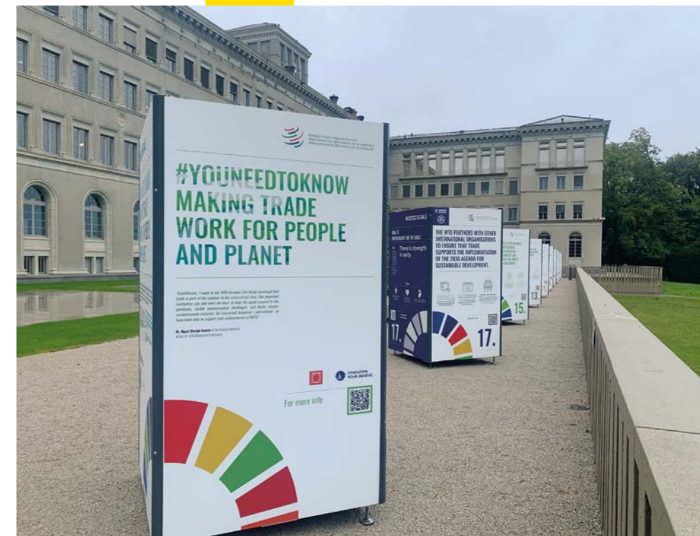
The #YouNeedToKnow exhibition at the World Trade Organization