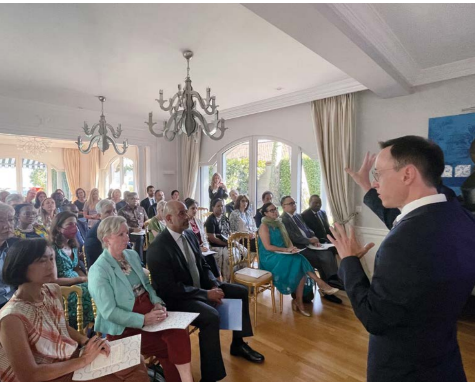
The SDG Lab team speaks about its work to representatives of Member States in Geneva.