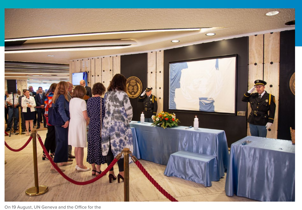
Coordination of Humanitarian Affairs commemorated World Humanitarian Day, paying tribute to the 22 persons, many of whom were UN staff members, killed in the devastating terrorist bombing of the Canal Hotel in Baghdad 20 years ago, as well as to all colleagues who have lost their lives in humanitarian service.