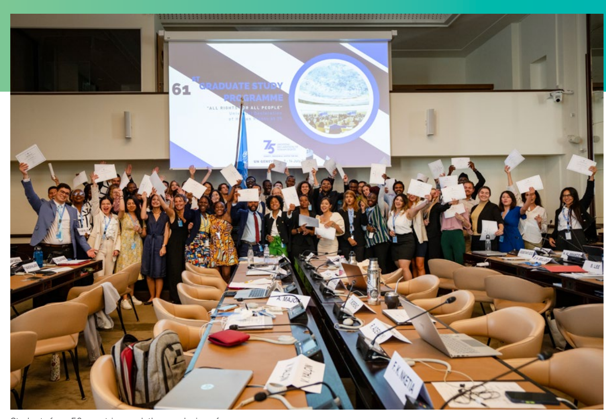
Students from 50 countries mark the conclusion of the sixty-first Graduate Study Programme, the United Nation's longest-running educational initiative, at UN Geneva on 14 July.