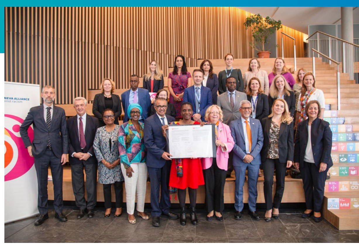
Twenty-two heads and representatives of Geneva-based United Nations entities gathered at the Palais des Nations on 5 October to sign a declaration affirming their commitment to the goals of the Geneva Alliance against Racism.