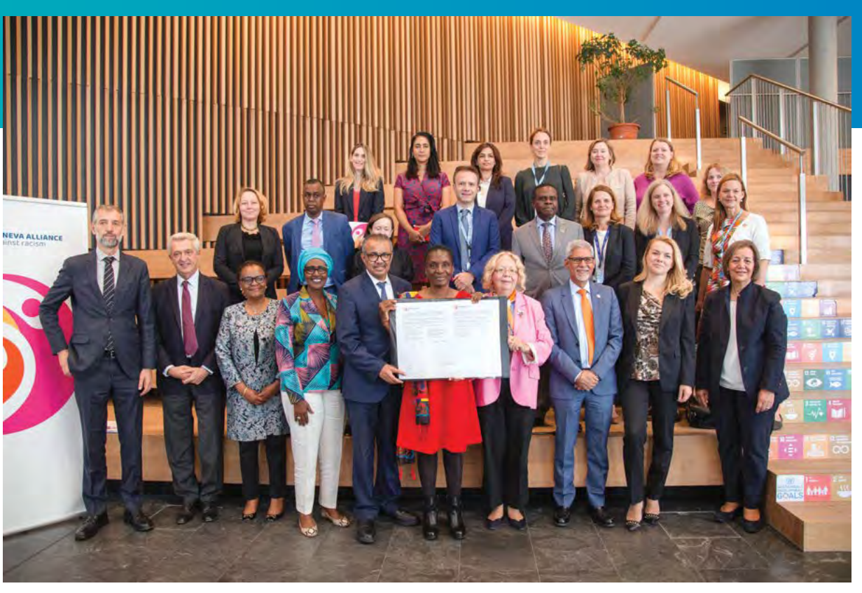
Twenty-two heads and representatives of Geneva-based United Nations entities gathered at the Palais des Nations on 5 October to sign a declaration affirming their commitment to the goals of the Geneva Alliance against Racism.