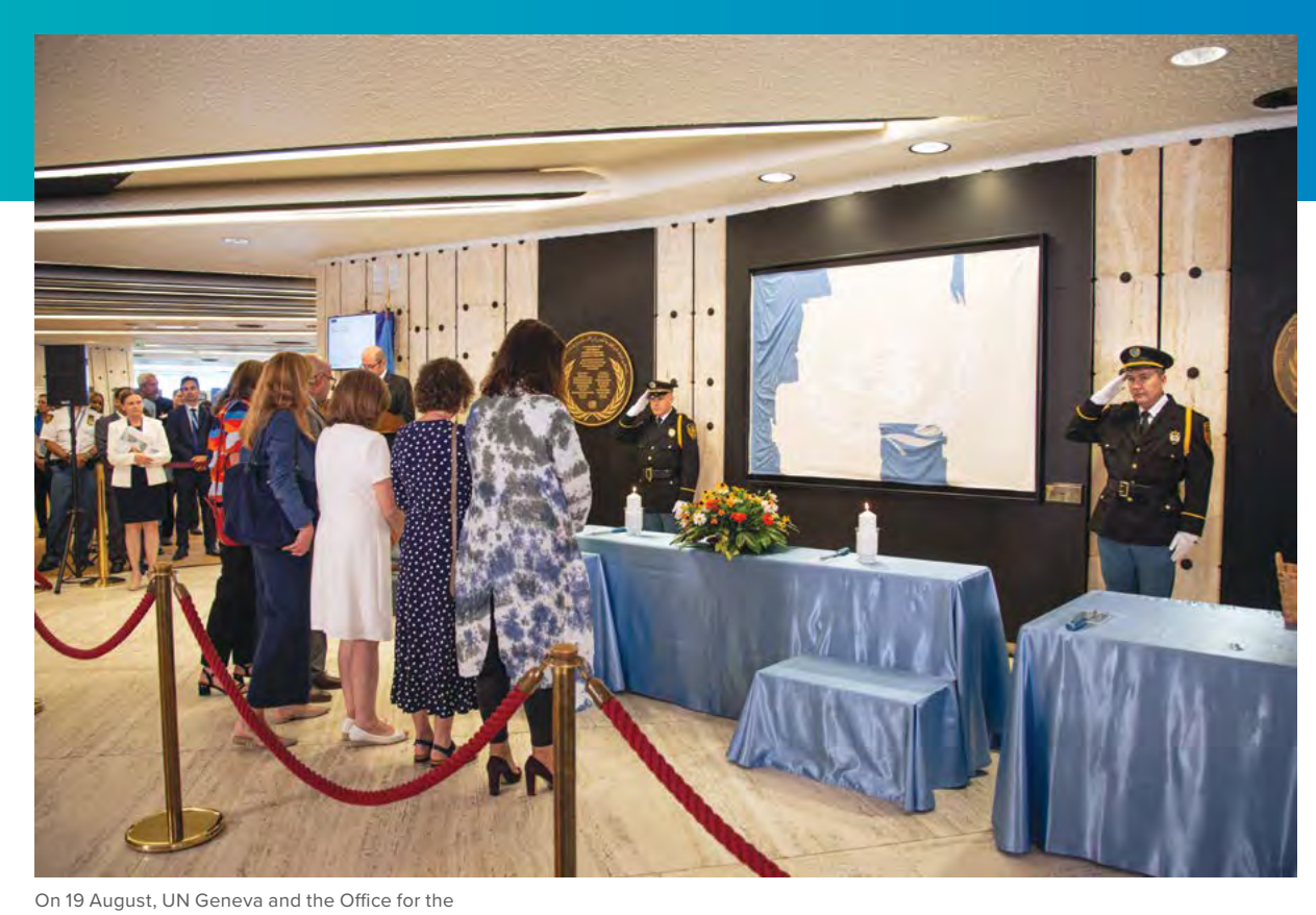
Coordination of Humanitarian Affairs commemorated World Humanitarian Day, paying tribute to the 22 persons, many of whom were UN staff members, killed in the devastating terrorist bombing of the Canal Hotel in Baghdad 20 years ago, as well as to all colleagues who have lost their lives in humanitarian service.