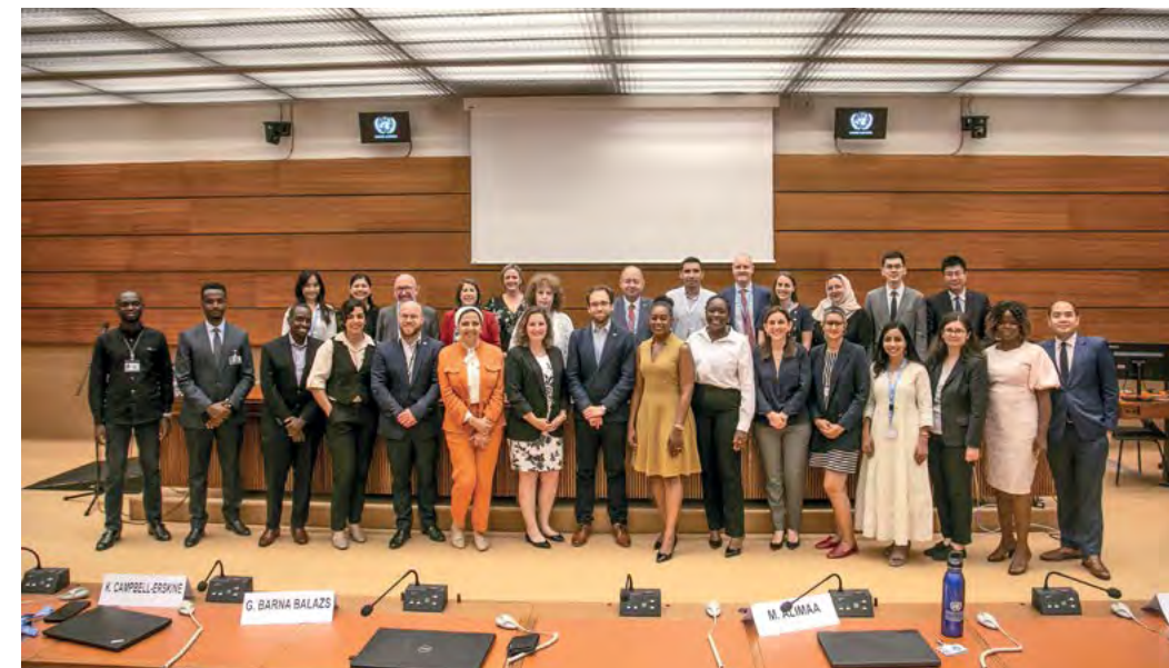
Participants in the 57th session of the International Law Seminar pose for a group photo.

UN Geneva has organized the International Law Seminar since 1965, in connection with the annual session of the International Law Commission. The Seminar is aimed at promoting knowledge of the work of the Commission and the United Nations concerning the progressive development of international law and its codification.