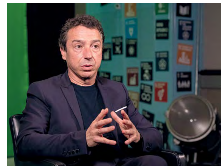
Singer and activist Joan Baez discusses climate change in the UNTV Geneva studio.