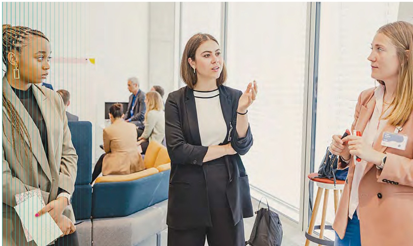
Participants exchange ideas at the SDG Lab workshop entitled "Setting the pillars of a new sustainability paradigm", held in collaboration with the Club of Rome on 5 May at the fifty-second St. Gallen Symposium.