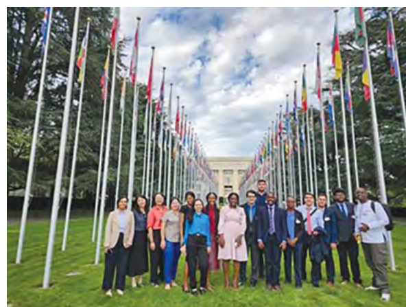
Participants in the Youth for Biosecurity Fellowship programme during their visit to the Palais des Nations in August.

On 22 August, UN Geneva welcomed a group of Hiroshima and Nagasaki Peace Messengers, who visited the Palais des Nations and attended a meeting of the Conference on Disarmament.