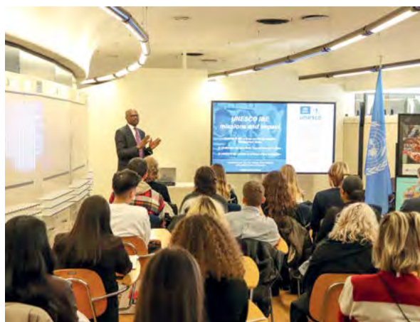
School students attend a UN@School briefing with the Geneva-based International Bureau of Education of the United Nations Educational, Scientific and Cultural Organization.

The United Nations and its partners navigate a complex landscape of global challenges in a fragmented world. The UN@School initiative, which was launched in 2020 by UN Geneva's Perception Change Project and the Eduki Foundation with the aim of igniting students' passion for the work of the United Nations, continues to be a dynamic force, bringing together students and international organizations in Geneva. In 2023, 11 sessions were held involving over 200 enthusiastic school students, aged from 17 to 19, from six cantons of Switzerland. The students engaged in active discussions on topics such as the Human Rights Council, conflict in the Syrian Arab Republic, food security and international trade. Through the UN@School initiative, UN Geneva aims not only to impart knowledge, but also to instill a fervent sense of global citizenship and inspire young minds to tackle the world's most pressing challenges with determination and zeal.